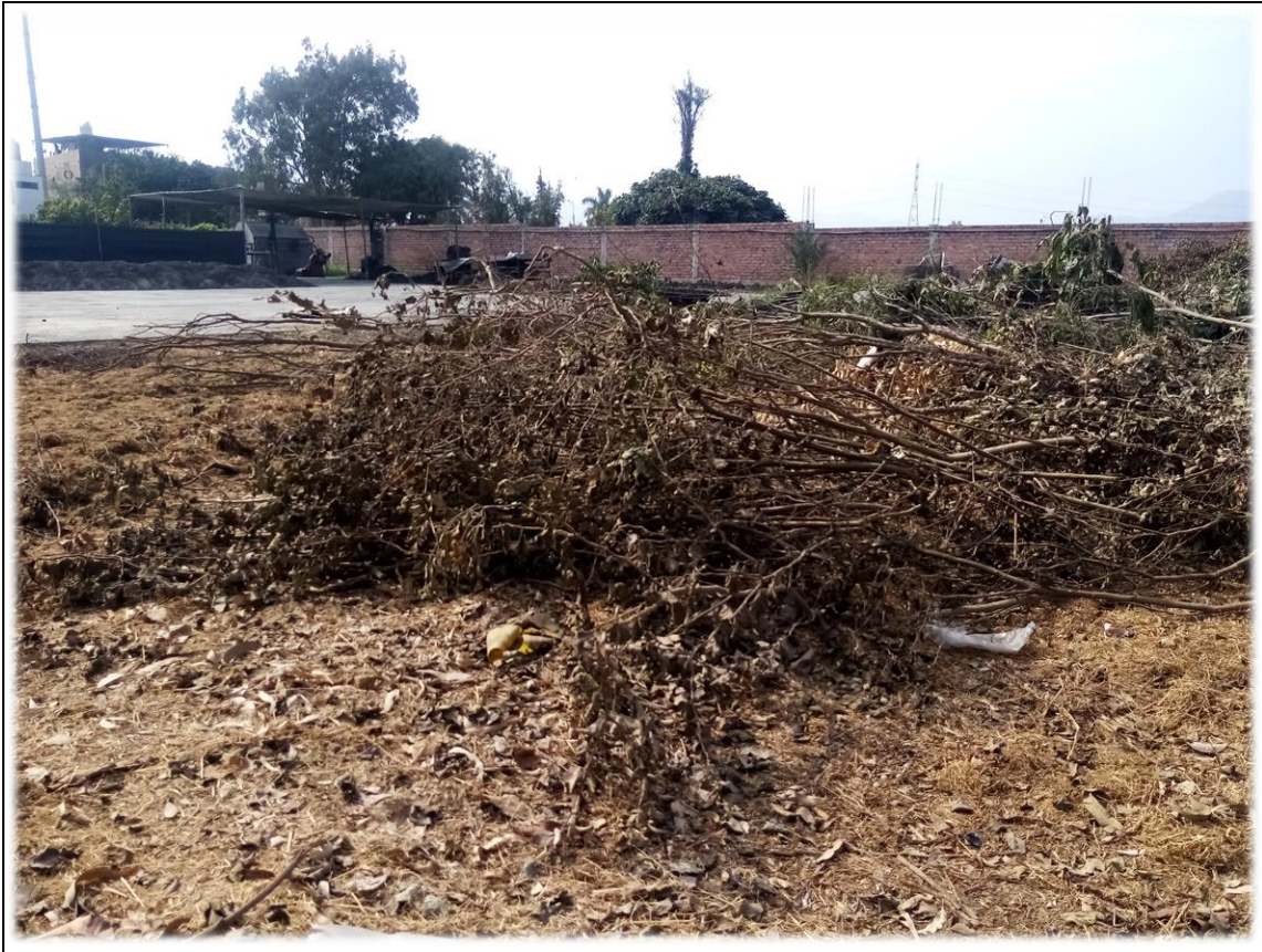
Figure 1. Municipal green waste is a heterogenous mixture that includes components (cut grass) for which composting is an ideal waste management strategy. There is also a woody component obtained via pruning trees and shrubs that would require additional processing (chipping) before composting becomes a viable strategy. The woody component is also likely to contain a high lignin content which will increase the time, cost and emissions of composting.