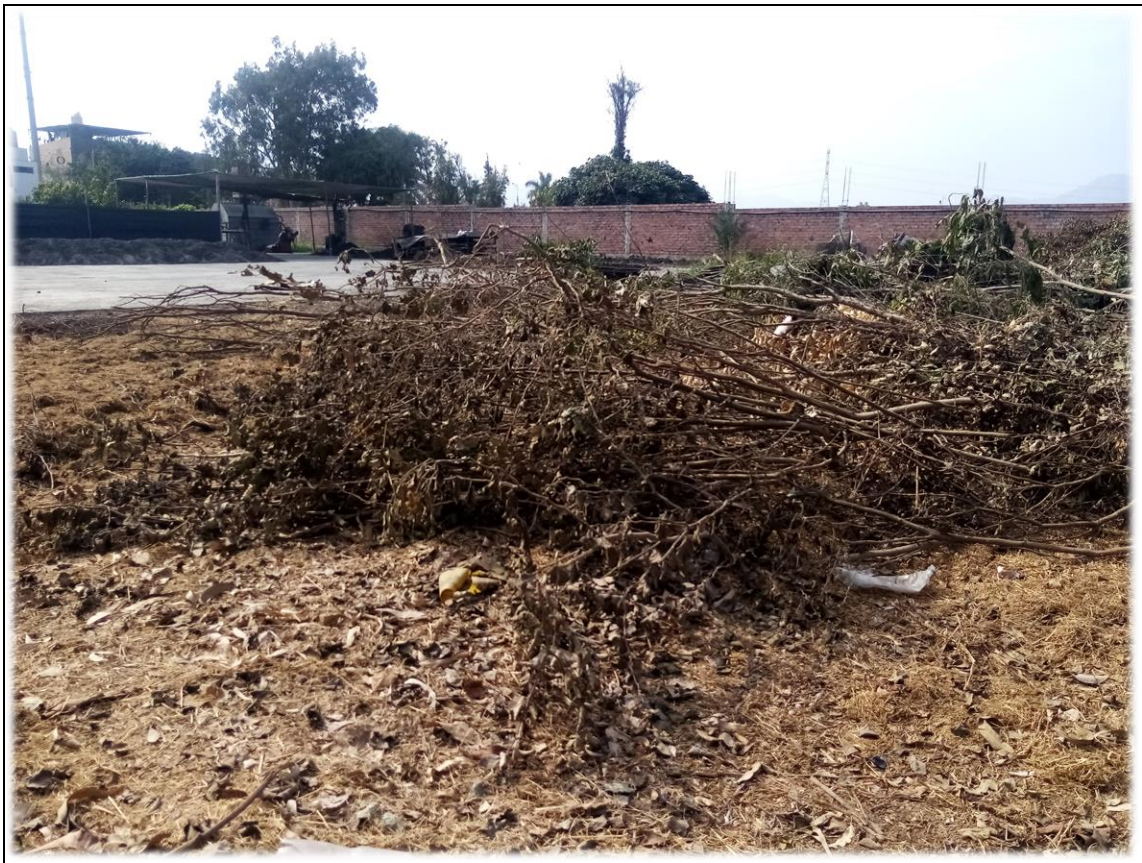
Figura 1. Los residuos verdes municipales son una mezcla heterogénea que incluye componentes (césped cortado) para los que el compostaje es una estrategia ideal de gestión de residuos. También hay un componente leñoso obtenido a través de la poda de árboles y arbustos que requeriría procesamiento adicional (astillado) antes de que el compostaje se convierta en una estrategia viable. También es probable que el componente leñoso contenga un alto contenido de lignina, lo que aumentará el tiempo, el costo y las emisiones del compostaje.